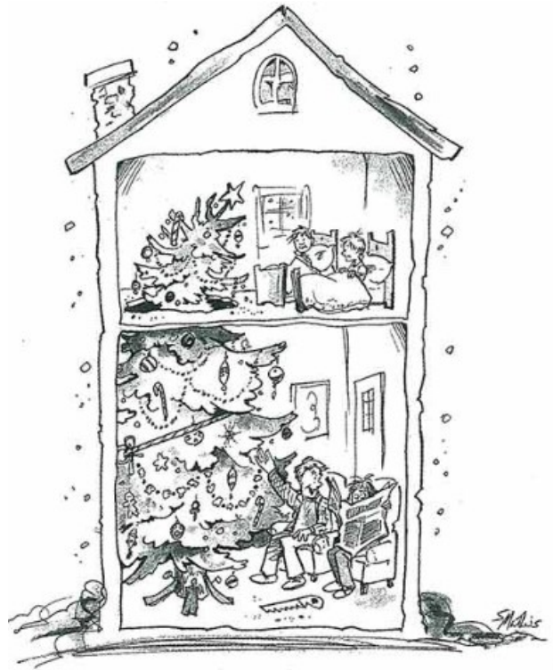
"See, Dear? Told you I'd make it fit!"